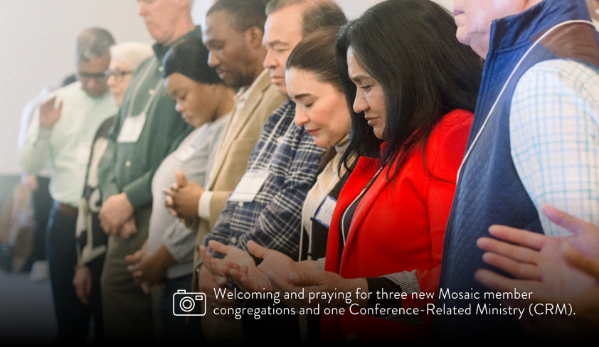
📷 Welcoming and praying for three new Mosaic member congregations and one Conference-Related Ministry (CRM).

“Our time spent drumming is us being Mosaic. When we drum, we are having fun together, soaking in scripture, listening to one another and our different rhythms, and making a beautiful song for God.”