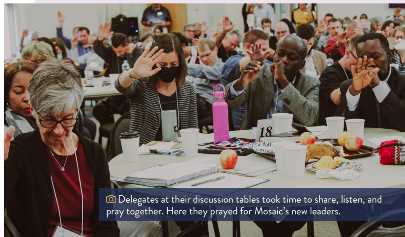
Delegates at their discussion tables took time to share, listen, and pray together. Here they prayed for Mosaic's new leaders.