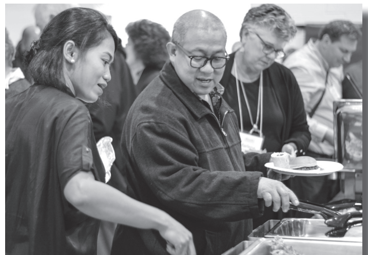
Delegates enjoyed Indonesian Fritters, tamales, sandwiches, ice cream, and more at Conference Assembly this year.