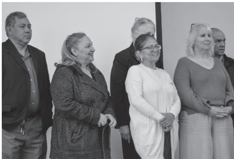
Members of Ebenezer Mennonite Church are welcomed during the business session at Conference Assembly.