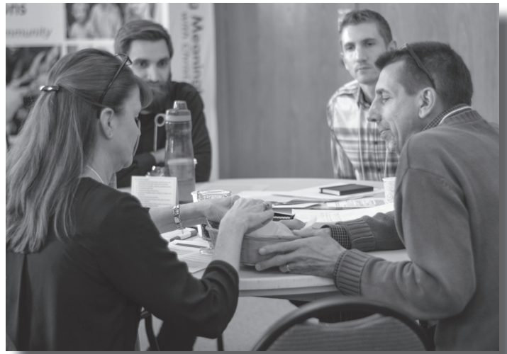
Delegates from both Eastern District and Franconia Conferences gathered after the reconciliation vote to serve one another communion.