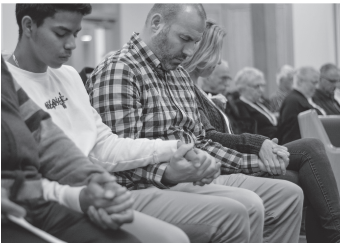
Worshippers join hands during the prayer.