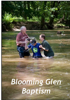
Blooming Glen Baptism